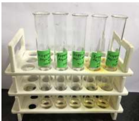
Figure 2: Evaluation of antioxidant effect using aqueous ethanolic extract by DPPH method, with test tubes labelled from 10 \mu l to 50 \mu l.