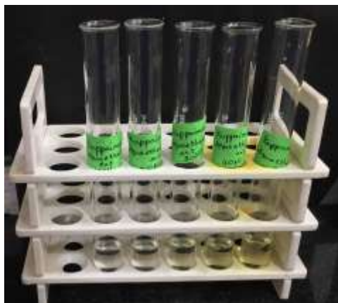
Figure 4: Evaluation of anti-inflammatory effect using aqueous ethanolic extract by albumin denaturation assay, with test tubes labelled from 10 \mu l to 50 \mu l.