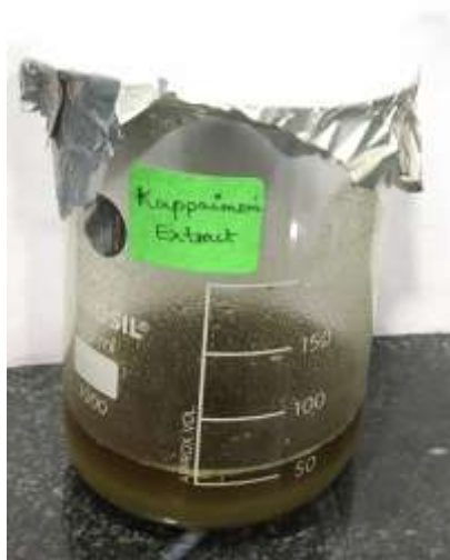
Figure 1: Prepared aqueous ethanolic extract of Acalypha indica

The coarse powder of Acalypha indica (1gm) was mixed with 25 ml of distilled water and ethanol in a 250 ml beaker. Then the solution was kept in a shaker under room temperature for 24 hrs to remove the ethanol by evaporation. After 24 hrs, it was heated at 45- 50 C for 10 minutes. The mixture was then filtered in a conical flask using filter paper. Then the obtained aqueous ethanolic extract of the plant was stored in a refrigerator for further use. Therefore, the extract was then used to evaluate the antioxidant and anti-inflammatory activity using the DPPH method and albumin denaturation assay.