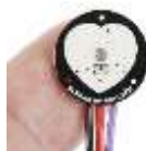
Figure 2:Heartbeat sensor

The heartbeat sensor gives a simple method to become familiar with the pulse, which can be estimated dependent on the standards of mental and actual signs utilized as a genuine program boost. The measure of blood on the finger changes over the long run