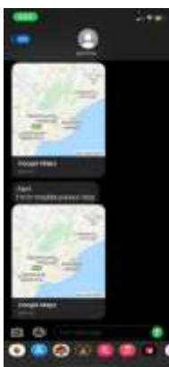
Figure 7: Alert message