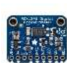
Figure 5: Tilt sensor

An accelerometer is a device used to gauge the speed of development or development of a structure. The power brought about by vibrations or changes moving (speeding up) makes the item "choke" the piezoelectric material, making an electrical charge with respect to the power applied on it.