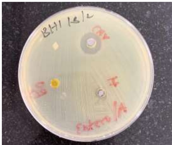
Figure 2: The figure represents the zone of inhibition of the antimicrobial activity exhibited by honey, orange peel extract and chlorhexidine against E. Faecalis .