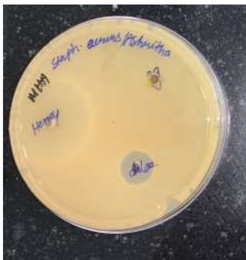
Figure 3: The figure represents the zone of inhibition of the antimicrobial activity exhibited by honey, orange peel extract and chlorhexidine against Staphylococcus aureus .