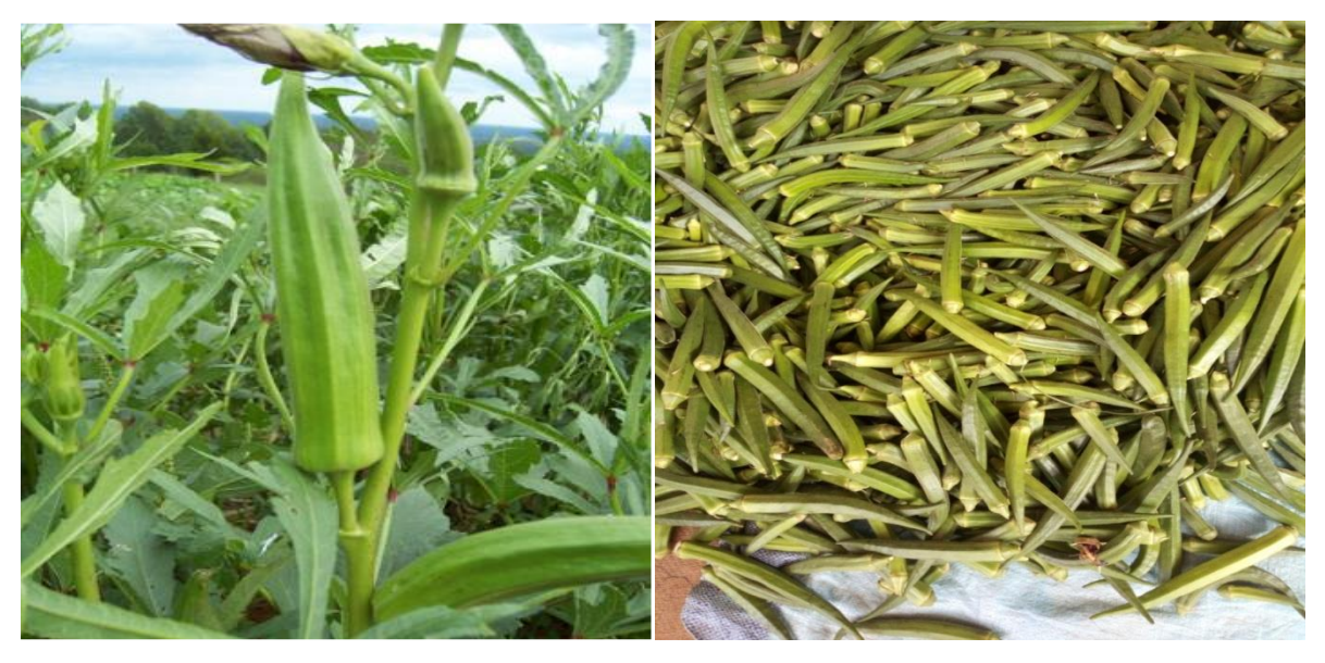
Figure 1. Abelmoschus esculentus L

Okra is rich in phenolic components which have remarkable pharmacological and antioxidant activities <sup>[14]</sup>. The flavonoid constituents of seed extracts showed enhanced cytotoxic effects on human-derived breast cancer cells (MCF-7) in comparison with hepatoma cells of human origin (HepG2) and human cervical cancer (HeLa) cells in a dose-dependent manner. These observations affirmed that the flavonoid isoquercitrin, in a synergistic association with other flavonoids, inhibited vascular endothelial growth factor (VEGF), resulting in the apoptosis of cancerous cells<sup>[26]</sup>.