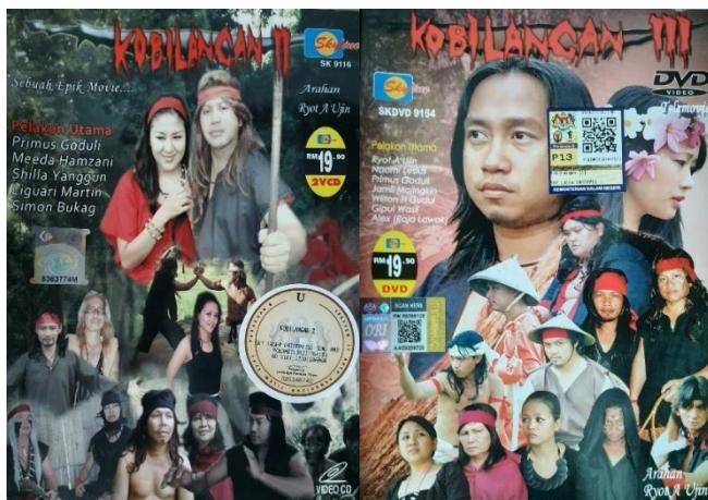
Figure 1: Pictures of the disc cover for 'Kobilangan 2' and 'Kobilangan 3'