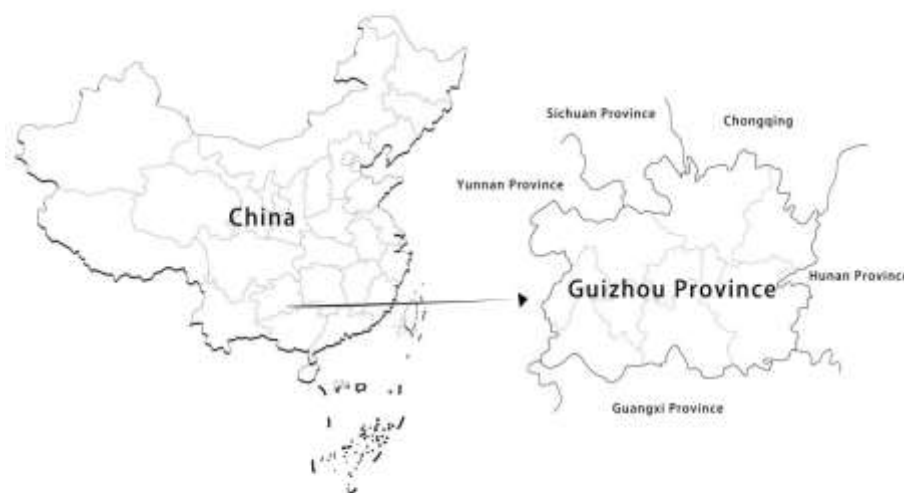
Fig. 1. Guizhou Province, China

The Bouyei people, who have no national characters, use batik patterns to replace the language function of characters and symbols, imparting their shared sense of production and life, history and culture, religious beliefs, and ancient customs to future generations a distinctive batik pattern. For Guizhou Bouyei batik, Zimei Lu [2] believes that Guizhou Bouyei batik occupies an important position in the history of dyeing and weaving in China. Among them, Bouyei batik has unique artistic charm and aesthetic concepts in pattern modelling and texture. Bouyei ethnicity batik contains various patterns, quietly elegant patterns, beautiful colours, clearly visible and looming liberal arts and sciences, rich cultural connotation, aesthetic connotation, and spiritual temperament. It is a precious artistic material for the study of Bouyei culture.