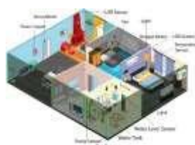
Figure 2: Simulated Model of Proposed Smart Home.

Figure 2 shows the reproduced model of proposed home robotization. At the introductory stage, the kitchen and one room are robotized alongside the primary entryway. The gas sensor is coordinated in the kitchen at the fitting area. Ecological sensors are coordinated both in the kitchen and room. The stepper engine is just coordinated with room draperies and the servo engine is fixed at the principal entryway. Every one of the sensors apparatuses are connected with the raspberry pi and continuous detected information is moved over Thing Speak.