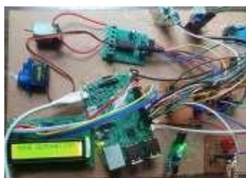
Figure 3: Smart Home Implementation.

the framework is executed; Sensor information is being checked over the Thing Speak cloud channel. In this home robotization, at whatever point there is no inhabitation distinguished by the IR sensors, all the apparatus will wind down naturally, and on the off chance that inhabitation is identified at any part of the room, the machines will get turned ON as needs