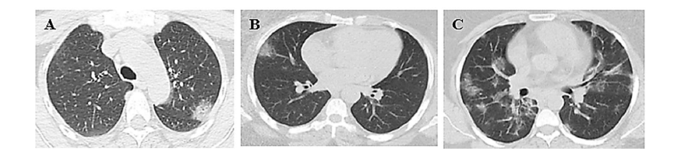
Fig. 2 . Patterns distribution of the COVID-19 lesion. A. 51-year-old symptomatic female presenting with fever. Axial CT image shows unilateral GGO was demonstrated in the left lobe. B. 44-year-old asymptomatic female. CT image shows GGO was demonstrated in the peripheral right upper lobe. C. 36-year-old asymptomatic female. Chest CT shows diffuse bilateral GGO with the peripheral distribution.