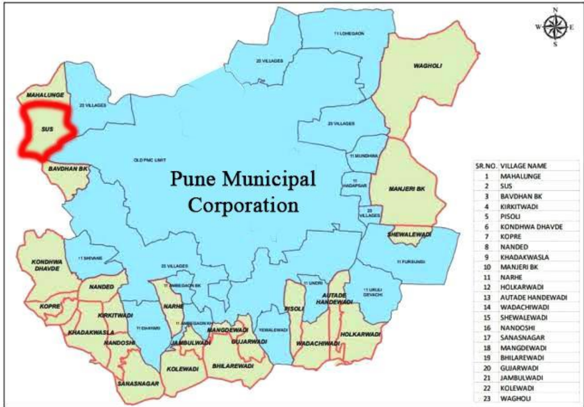
Figure 1: Map of extension of Municipal Corporation highlighting study area