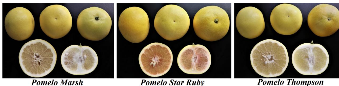
Figure 1: Accessions of the pomelo

The samples of three varieties of Pomelo: pomelo thompson, pomelo star ruby and pomelo marsh grafted on citrange troyer, planted in June 1995 in the experimental field El Menzeh of INRA-Kenitra. They were harvested during the two companies 2018/2019 and 2019/2020 to have better results.