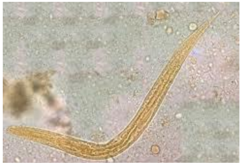
Fig. 2. Larva of Strongyloides papillosus

Table 1-Infestation of mountain sheep with eimeria, strongyloid and eimeria-strongyloid infestations