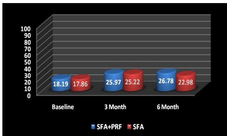
Graph 1: Inter group comparison of Full Mouth Plaque Score

Table 3 shows the intra-group comparison of full mouth gingival index. The gingival bleeding score was calculated at specific time intervals to identify if the gingiva was presenting signs of gingival inflammation. The Full mouth bleeding Scores were calculated to indicate the overall gingival inflammation level in the mouth during the period of investigation. The gingival bleeding score in the SFA alone group had a mean score of 22.61 at baseline, which decreased to 15.89 at three months and thereafter slightly increased to 16.5. In the SFA + PRF group, the baseline score of 22.61, reduced at the three month point to 18.12 before increasing to 28.61 at the six-month point. On comparison of the gingival inflammatory status within the groups, only the SFA alone group had a mildly significant difference at the third month point.