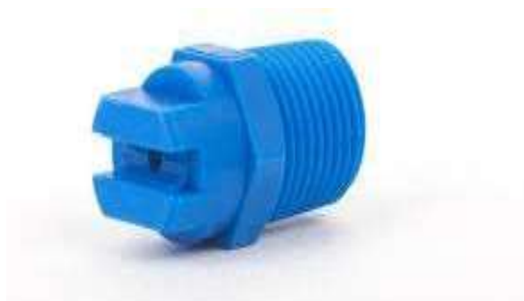
Figure 5. flat fan nozzle

adequate coverage at the intended application rate and pressure. Minimizing drift is especially important for herbicides.