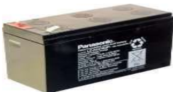
Figure 2. battery

In isolated systems away from the grid. Batteries are used for storage of excess solar energy converted into electrical energy. The only expectations are isolated sunshine load such as irrigation pumps or drinking water supplies for storage. In fact for small units with output less than one kilowatt. Batteries seem to be the only technically and economically available storage means. Since both the photo-voltaic system and batteries are high in capital costs. It is necessary that the overall system be optimized with respect to available energy and local demand pattern.