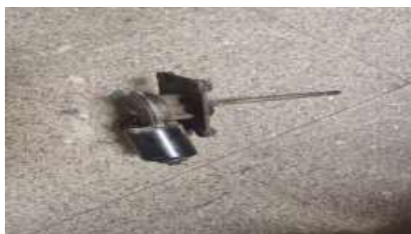
Figure 1. DC Motor Specifications:

An electric motor is a machine which converts electrical energy to mechanical energy. Its action is based on the principle that when a current carrying conductor is placed in a magnetic field, it experiences a magnetic force whose direction is given by Fleming's left hand rule. When a motor is in operation, it develops torque. This torque can produce mechanical rotation. DC Motors are also like generators classified into shunt wound or series wound or compound wound motors. The result is to flux density into the region directly above the conductor and reduce the flux density in the region directly below the conductor. It is found that a force acts on the conductor, trying to push the conductor downwards as shown by the arrow. If the current in the conductor is reversed, the strengthening of the flux lines, lines occurs below the conductor, and the conductor will be pushed upwards.