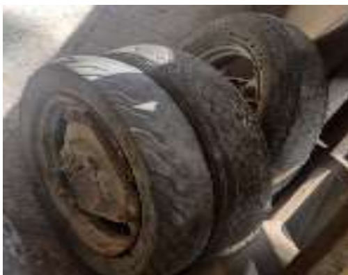
Figure 7. Wheels