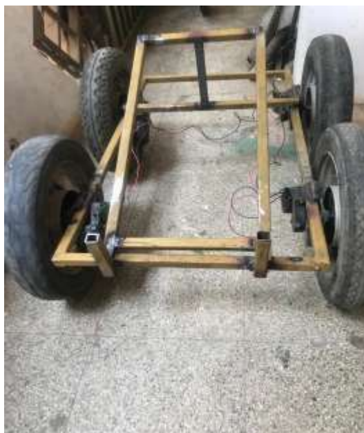
Figure 12. Front view of the model