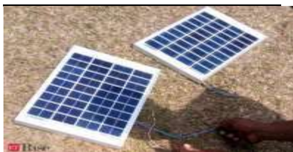
Figure 3. solar panel Specifications:

A solar panel, or photo-voltaic (PV) module, is an assembly of photo-voltaic cells mounted in a framework for installation. Solar panels use sunlight as a source of energy and generate direct current electricity. A collection of PV modules is called a PV panel, and a system of panels is an array. Arrays of a photovoltaic system supply solar electricity to electrical equipment.