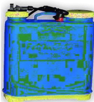
Figure 8. Pesticide Tank Specifications:

A pesticide tank are storage are containers that hold liquids compressed gases o mediums used for the short or long term storage of fluids or gases. The term can be used for reservoirs. Storage tanks are available in many shapes: vertical and horizontal cylindrical open top and closed top flat bottom, cone bottom, slope bottom and dish bottom. Large tanks tend to be vertical cylinders, or to have rounded corners transition from vertical side wall to bottom profile, to easier withstand hydraulic hydrostatically induced pressure of contained liquid. Most container tanks for handling liquids during transportation are designed to handle varying degrees of pressure.