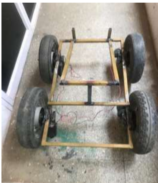
Figure 11. Top view of the model