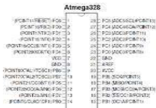
Figure 4. microcontroller Specifications:

Our system is vehicle type system; hence we need to control the system using a microcontroller. We use ATMEGA LM 328 microcontroller to control our system. This microcontroller having four ports. We use port number Three for the Bluetooth connection. The transmitter of the microcontroller is connected to the receiver Of Bluetooth is connected to transmitter of microcontroller. Following figure shows the pin diagram of microcontroller ATMEGA LM 328.