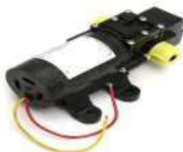
Figure 6. DC Pressure Pump

Diaphragm pump combines the advantages of self-priming pump and chemical pump. Installed in a dry, well-ventilated location; pumps can not work in water. Using a variety of imported corrosion-resistant materials, self-priming, thermal protection, smooth operation, long-time continuous idling, long-time continuous load operation. Totally sealed, high stable pressure. Bracket can absorb vibration from the pump when working. When the water pressure is too high, pump will protect themselves and normal work, water pipes will not burst, it is safe and durable. Pressure protection: pressure switch power protection. The maximum flow of 5 L /min The work: intermittent service (continuous working at different working pressures at different times) The use of media: water or solvent PH value 5–8, oil. Service life: more than 500-1000 hours of continuous work