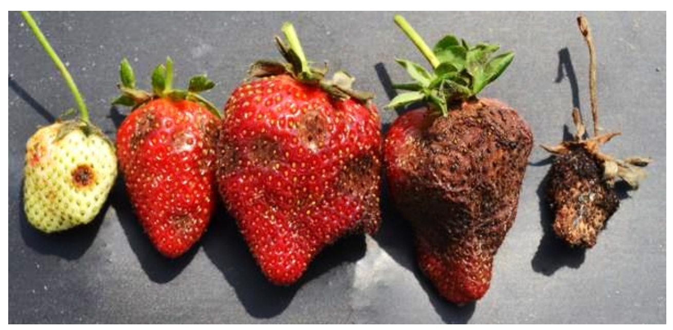
Figure 1. Anthracnose Fruit Rot showing a range of symptoms on green and ripe fruit, including newly formed lesions, fruit nearly covered by lesions and spores, and a mummified fruit that has desiccated.