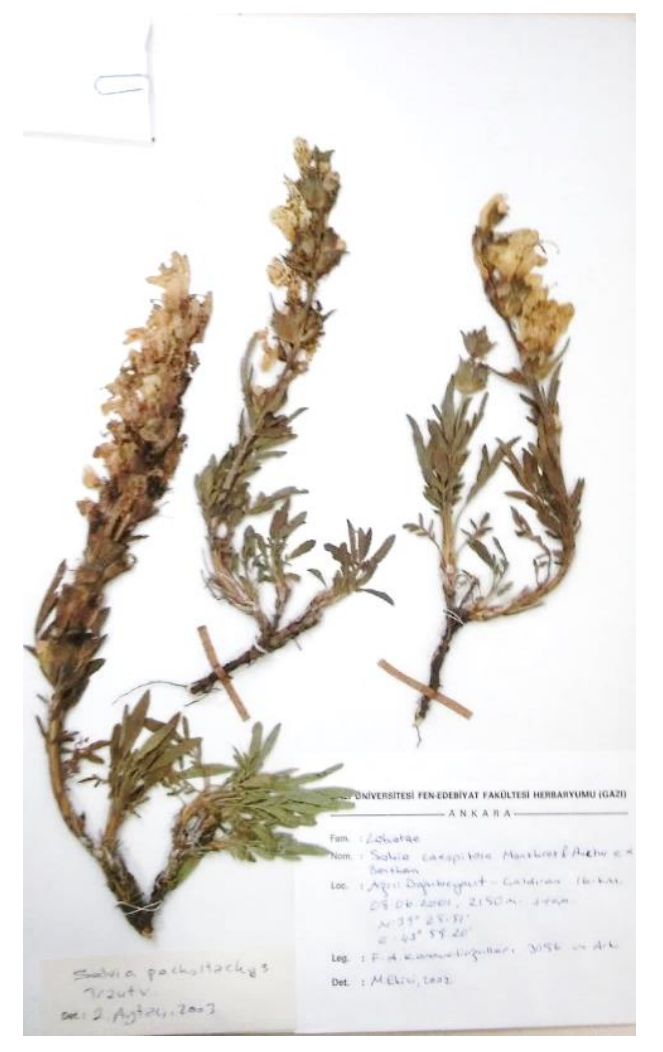
Figure 2. Herbarium specimen of the Salvia pachystachya

The air-dried plant materials (flowers, leaves, and stems) were subjected to hydrodistillation for 3 hours using a Clevenger-type apparatus in 2001. The oil yield was calculated as 0.15%, v/w on dry weight basis and oil was stored at 4°C in the dark until analyzed.