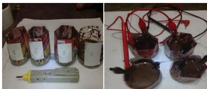
Figure 1. Test Series Without Additional Materials

The results of each composition can be seen as table 2 shows that the results of the best composition values with a comparison of the composition of 2 grams of salt added to Moringa paste ingredients produce a voltage of 1.73 Volts with an electric current of 0.843 mA and a power of 1.45 milli Watts in the test. in a parallel circuit system.