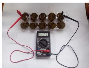
Figure 2. Parallel voltage measurement in battery cells.