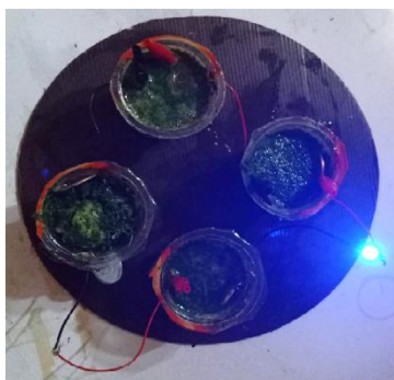
Figure 4. Testing the LED (Light Emitting Diode) in Parallel Circuit