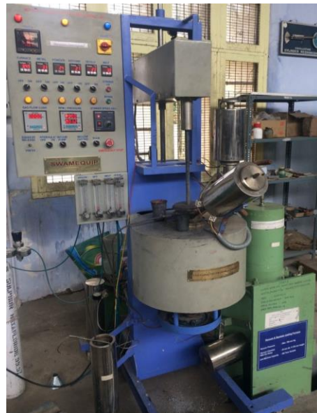
Fig. 6 Stir casting setup

Aluminium bars are cut to get the required weight to be placed inside the furnace. After the aluminium is melted inside the furnace, reinforcement is added in to the furnace with the help of silver container using tongs in the gradual manner.