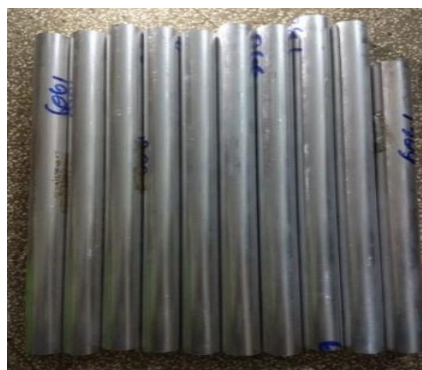
Fig. 2 Aluminium 6061