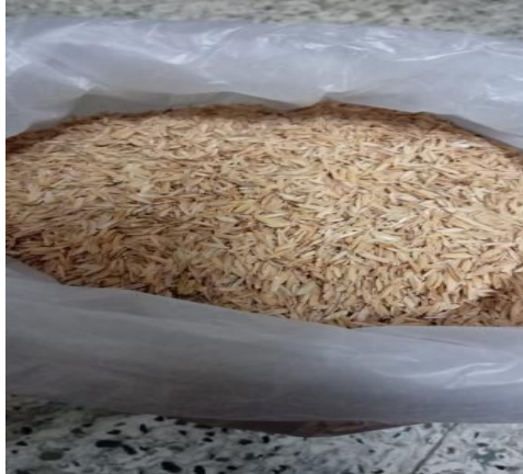
Fig. 3 Rice Husk

Rice husk ash is the second reinforcement for the fabrication of hybrid composite. It is identified from the literature survey that on adding rice husk ash the wear properties, tensile properties and hardness increases. When rice husk ash was reinforced with Al 6061 it was found that the density of the composite was less than that of Al 6061. Rice husk ash was shown in the Figure 2.