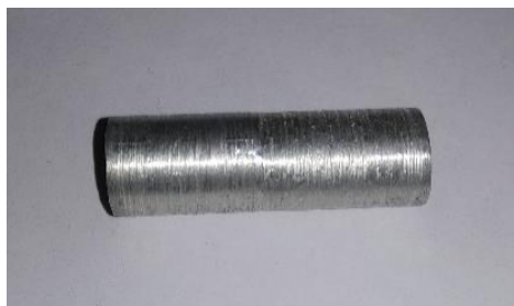
Fig. 9 Pin for wear test

The pin for wear test is shown in the figure 9. The disc was polished using the emery sheet before the process was started. The pin was placed between the fixed and the movable dies and was tightened using the Allen screws. It is to be ensured that the pin touches the disc properly. The parameters loaded before the experiments are as follows: 3 Kg of load is applied with the sliding velocity as 3 m/s. The speed for testing is 573 rpm and the sliding time of 16minutes 40 seconds was set and the process was carried out. The wear rate is calculated by taking weight of the specimen before and after the wear test. From the change in weight the percentage of wear is calculated. The wear test was done for all the four specimens and the process was carried out for all the specimens without changing the parameters.