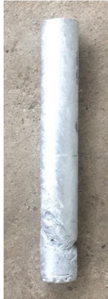
Fig. 7 Stir casted rod

In order to increase the homogeneity stirring is used. Effective stirring action is based on the stirrer profile, stirring speed and stirring time. At the first trail reinforcement of 1% combination is added without preheating and casting is made by the mould. Here, most of the reinforcement particles are obtained as the slag. This shows the wettability between the reinforcement and matrix is poor. In order to increase that property reinforcement is preheated and then added. The stir casting setup is shown in the figure 6. Stir casted hybrid composite rod was shown in the figure 7.