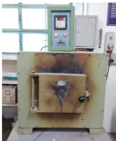
Fig. 4 Pretreatment of Rice husk

This process will change the colour of the rice husk ash from black to grayish white. The silica rich ash, thus obtained was used as the reinforcement material in the preparation of composite. The rice husk ash was prepared using the furnace shown in Figure 4.